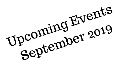
Full activities will resume the week of the 9th of September

September 12th .... General Meeting September 19th.... Birthday Brunch September 26th.... Community Lunch Coming Soon!!!! October 26, 2019 Conference